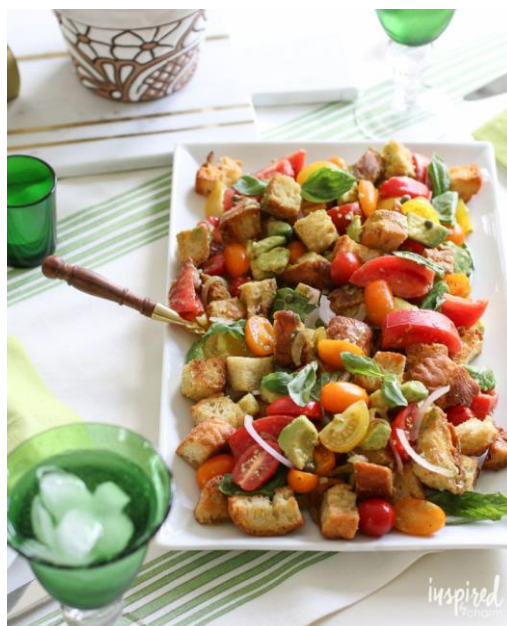
The Inspired by Charm blog showcased this California Avocado Panzanella recipe after receiving CAC's Dinner en Green summer entertaining kit.

The Dinner en Green California avocado kits inspired a fresh round of new recipes, perfect for summer entertaining. Blogger recipes ranged from panzanella salad to cool and creamy pies. Bloggers shared the recipes on their social media channels and websites, broadening consumer outreach during the peak California avocado season. The 2016 American Summer Holidays consumer public relations program has generated more than 95 million impressions this season.