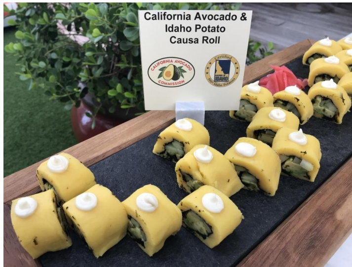
The versatility of fresh California avocado was showcased in a Causa Roll at the opening night reception.

Only chains with a strong presence in the Western U.S. will be contacted and offered menu promotion and ideation opportunities with CAC.