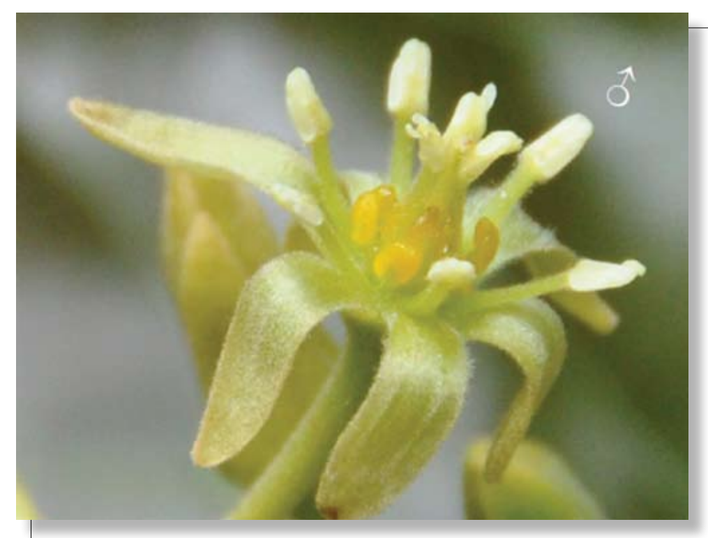
Female (top) and male (bottom) avocado flowers.