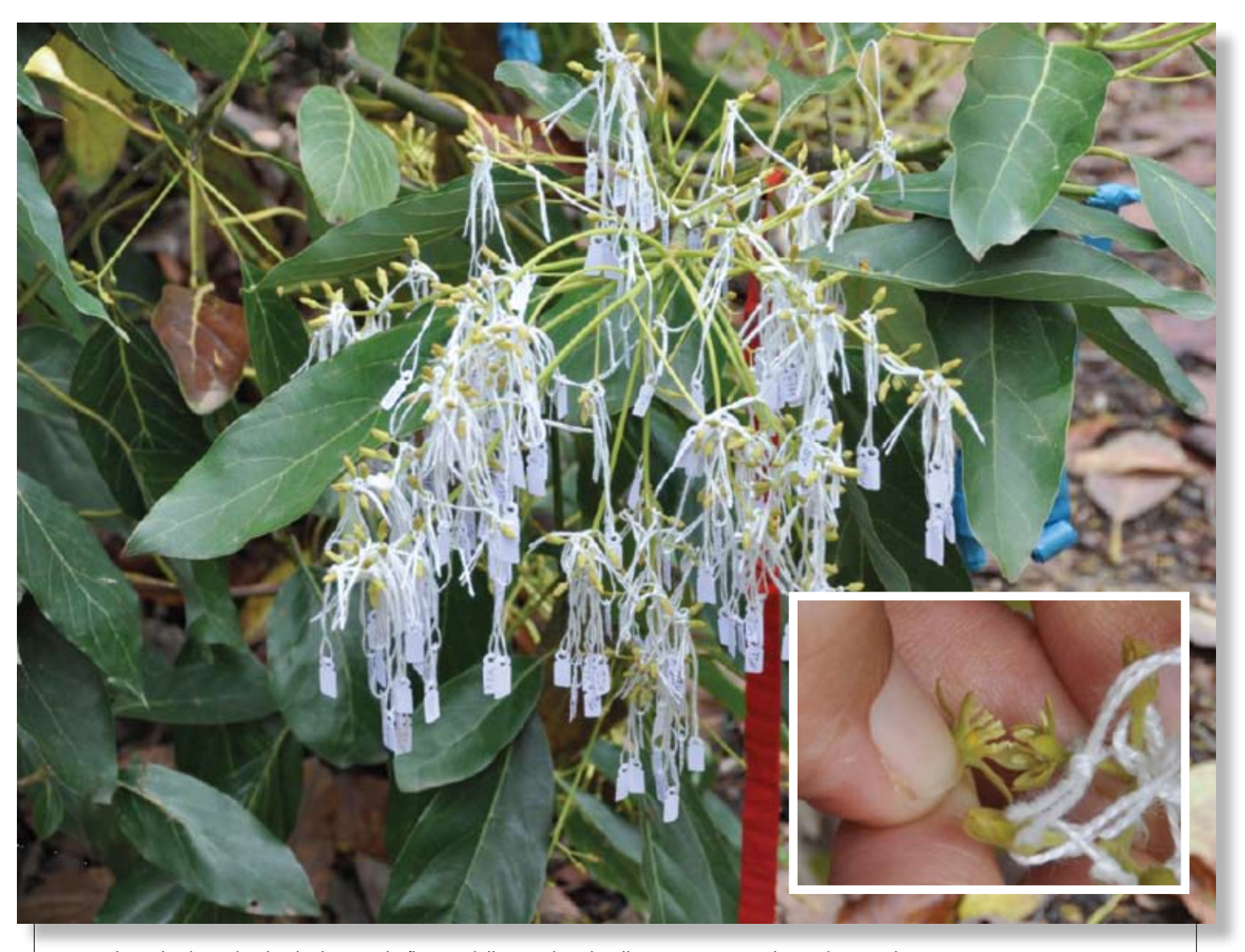
Tracking the fate of individual avocado flowers following hand pollination (inset).