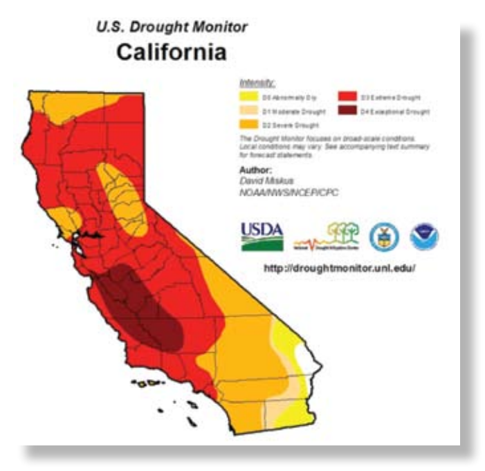
A map of California from the U.S. Drought Monitor showing the severe drought conditions covering much of the state as of February 13, 2014. More than 60 percent of the state is under extreme or exceptional drought conditions.

Probably the single best thing most growers can do to save water is to inspect, maintain and repair their irrigation system. Poly hoses should be inspected for leaks and