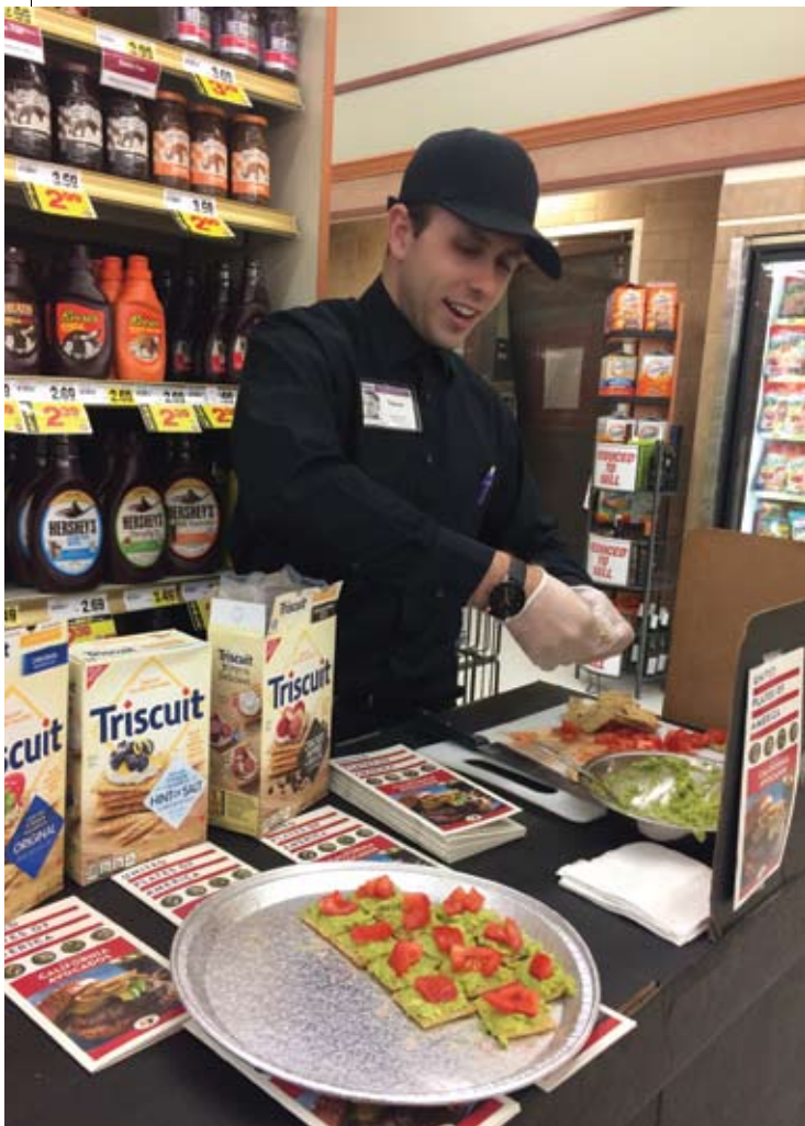
In-store demos at Stater Bros. showcased California avocados and tomatoes on crackers during Memorial Day weekend.

On the consumer side, the Commission engaged with California avocado fans on social media by sharing summer-friendly California avocado recipes, educational content and a new store locator tool. Recipes ranged from a California Avocado Key Lime Pudding to a cool and fruity California Avocado