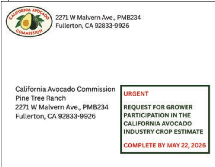
Front of Postcard.