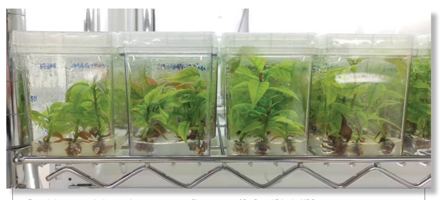
Figure 3. In vitro avocado shoots at the propagation stage.

system established by the researchers consists of sterilization, initiation, establishment, shoot proliferation, elongation and rooting. Researchers started by developing protocols to optimize the sterilization process and reduce the risk of contamination — successfully producing a surface decontamination method for juvenile and adult avocados. The researchers also discovered a new stage, which they called "establishment," was critical to propagation. Experiments led the researchers to identifying the critical components in the medium, thus successfully creating media where avocado shoots (explants) could initiate and establish in tissue culture. At this time, more than 50 cultivars and rootstocks have been successfully established.