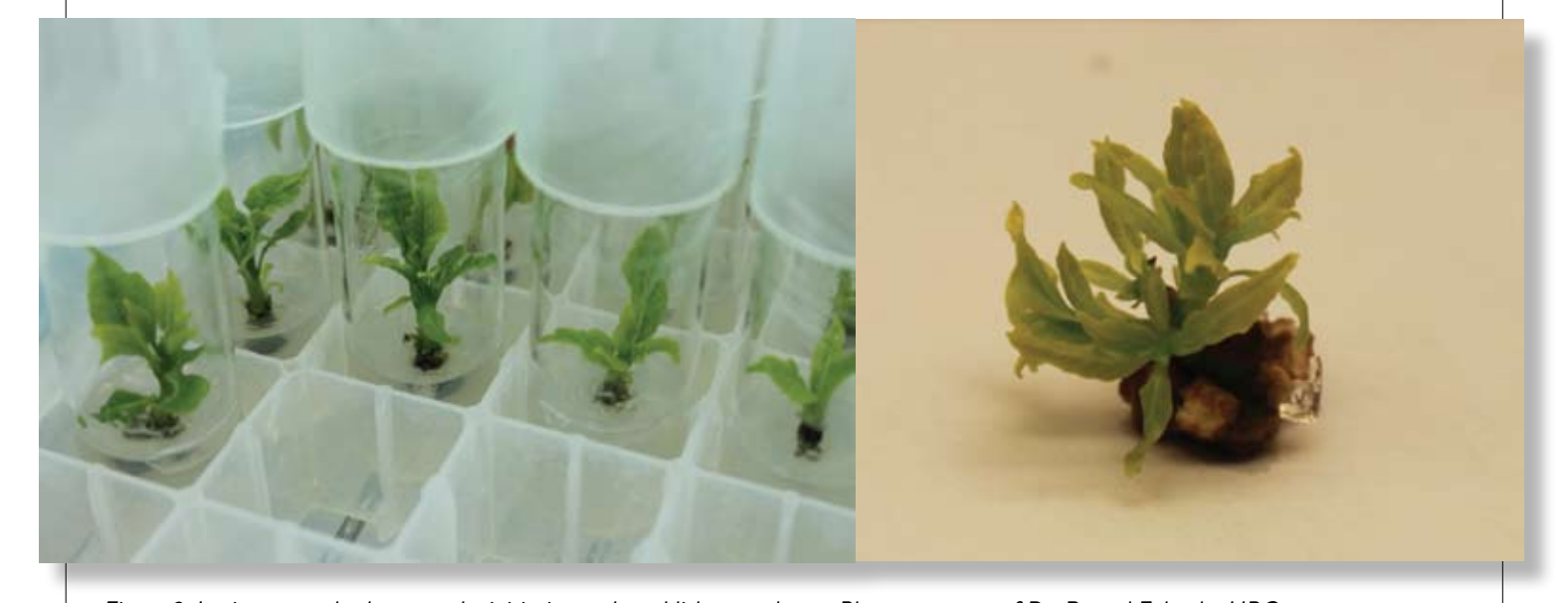
Figure 2. In vitro avocado shoots at the initiation and establishment phases.