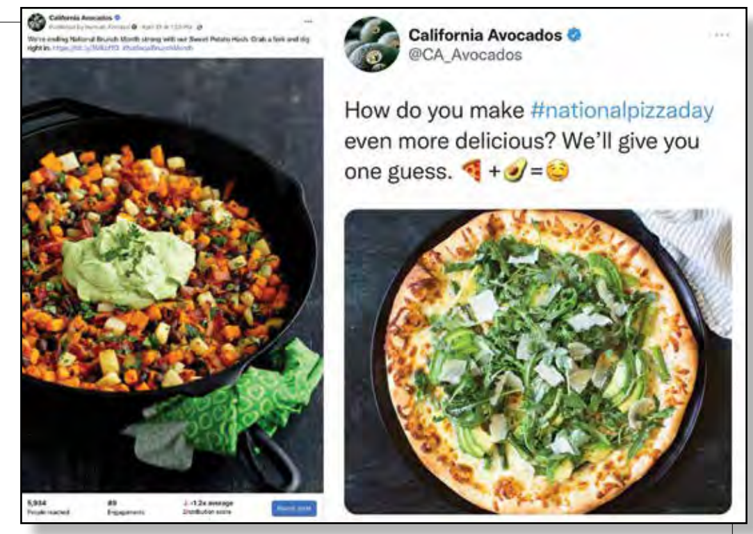
These posts inspire consumers to try new California avocado recipes tied into cultural moments like National Pizza Day.

The Commission's established social media channels — Facebook, Instagram, Pinterest and Twitter —also feature content to keep California avocados top of mind throughout the year. Posts are customized for pre-season and in-season time periods and focus on California avocado in-season messaging, recipe content, how-to content and merchandise support. Since February, now-in-season messaging and compelling visuals