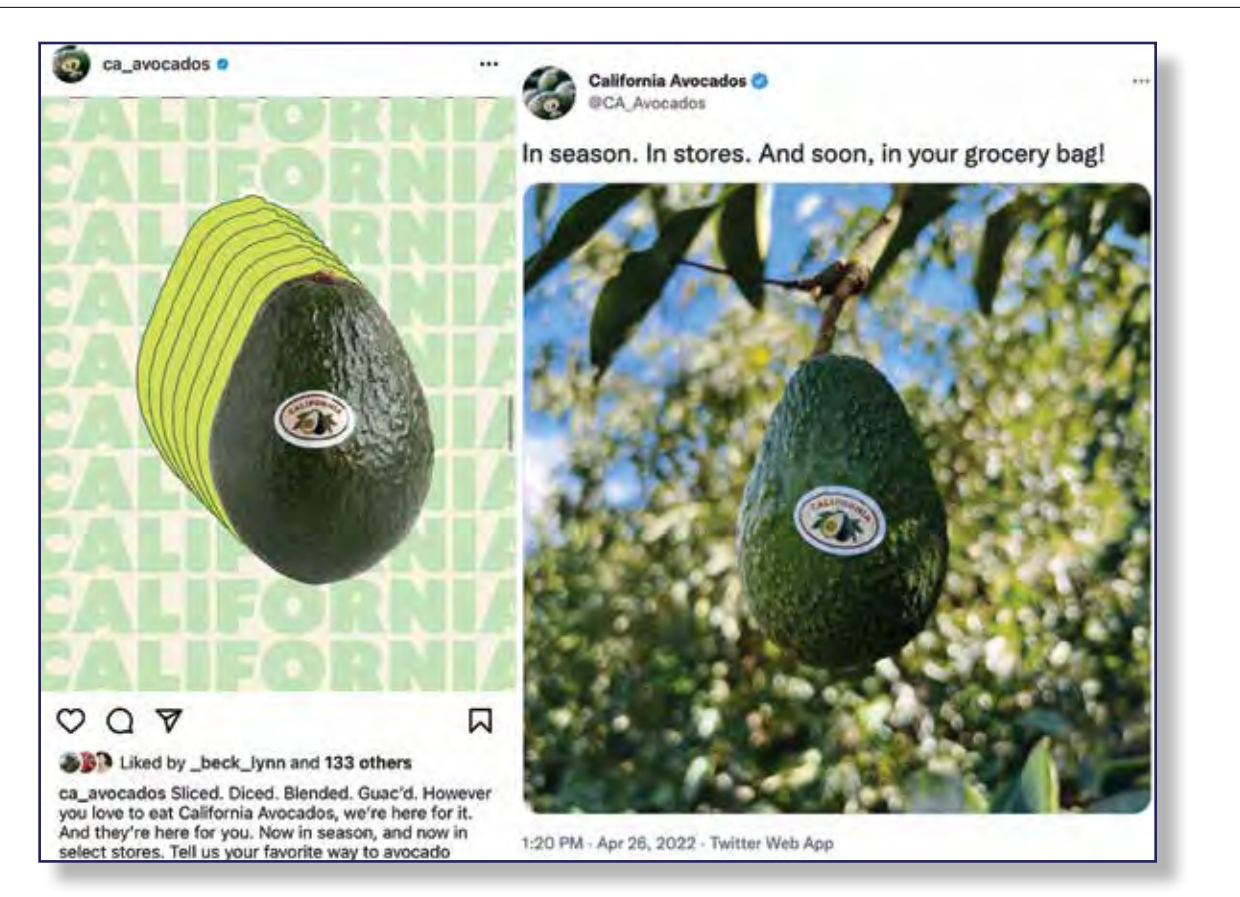
Two examples of in-season social media messaging encouraging consumers to seek California avocados in stores.

lifestyle posts that appeal to targeted consumers.