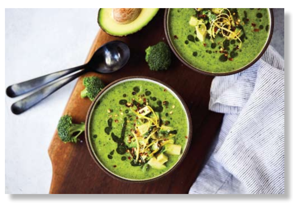
Brand advocates develop recipes targeted to reach consumers who are looking for ideas of high interest. With shoppers interested in reducing food waste, Beth Brickey created this No Waste Broccoli & California Avocado Soup.

This Sesame Seared Ahi Tuna and Grilled California Avocados dish utilizes simple grilling techniques to create an impressive entrée. On CaliforniaAvocado.com CAC calls out these recipe nutrition highlights, "high potency of dietary fiber (107% DV), protein (146% DV), plus B Vitamins; B5 (100% DV), B3 (330% DV), B6 (190% DV) and B12 (200% DV)".