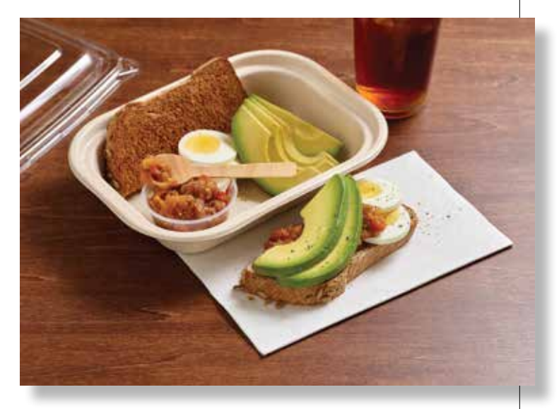
The Avocado and Egg Wheat Berry Toast Nosh Box recipe was used in the Commission's foodservice PR program.

Sharing a chef's recipe for an item that is on an establishment's menu is a powerful means of demonstrating to readers (including chefs and restaurant operators) that California avocados can successfully be added to any dish. Therefore, throughout the year the Commission's foodservice team researches chefs and restaurants in targeted markets to discover who is featuring innovative dishes with fresh California avocados on seasonal menus. The team seeks unique menu items that go beyond salads, cold sandwiches and burgers — like hummus with avocados, grilled cheese sandwiches topped with avocado slices, avocado corn dogs, a cauliflower ceviche with avocado and so on.