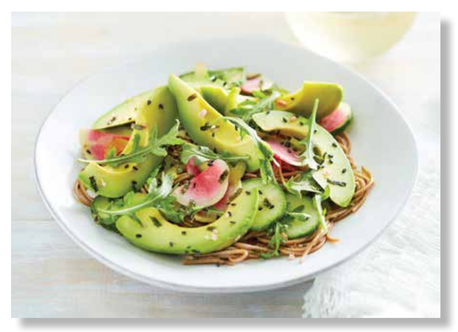
The Commission showcased the California Avocado and Miso Ginger Soba Noodles recipe to inspire operators in its foodservice outreach.

expand the editor's initial storyline and support the Commission's strategies. As an example, if a publication is publishing an article on Mediterranean cuisine the Commission would share the California Avocado Hummus recipe and chef contact with the editor. As a result, the editor now has the opportunity to supplement the article with a complementary signature dish and the chef can share with readers how they utilize local produce, such as California avocados, to put a unique twist on menu items.