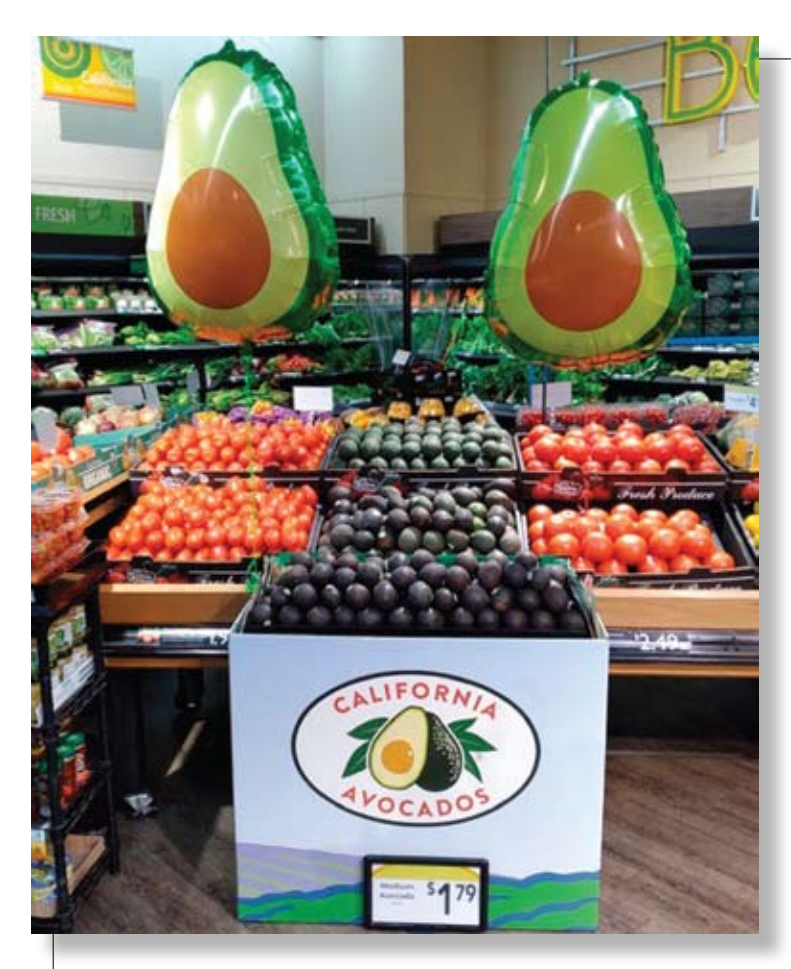
Save Mart locations took part in CAC's in-store display sales contest.

Markets conducted a California Avocado Blitz through the latter portion of the summer while Stater Bros. ran Summer Grill and Chill promotions and Sprouts highlighted the fruit as part of its California in-store campaign. Raley's featured fresh California avocados as part and parcel of their Summer Promotion and Safeway NorCal made a California-focused merchandising push and ran summer ad features. New Seasons conducted a focused push with a digital flyer showcasing the availability of California avocados and PCC Community Markets held a member event promotion to show how California avocados are perfect for all manner of summer occasions.