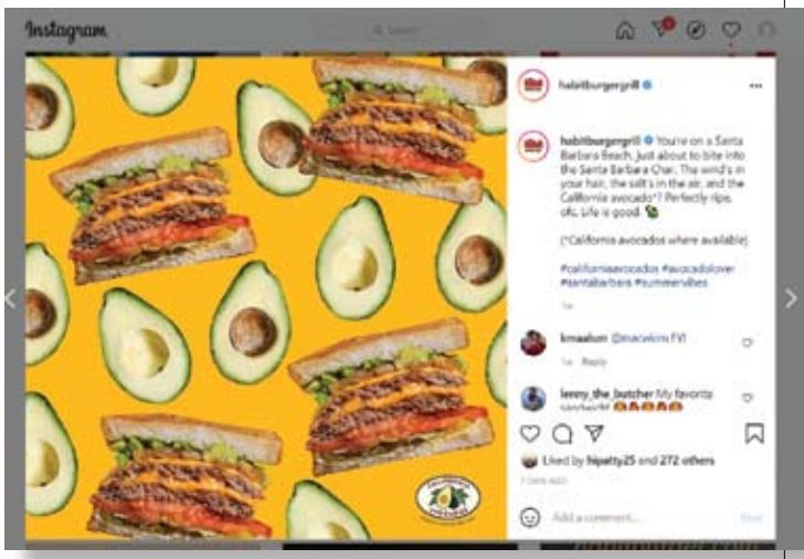
On its Instagram Habit Burger encouraged diners to enjoy its Santa Barbara Char Burger with fresh California avocados.

Partner retail and foodservice chain California avocado promotions reached consumers no matter where they were — on the street, in the car, at home, in the store or dining out — during the height of California avocado season. Coordinating and integrating on-site, digital and social media promotional activities provides the Commission with extensive opportunities to showcase what makes California avocados unique, the myriad ways they can be enjoyed and how the fruit is part of the iconic California lifestyle.