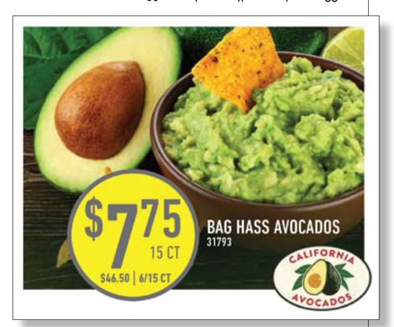
CHEF'STORE's bagged California avocado ad ran in in July.

California avocados were featured as the Dietitian's Pick of the Month for July at Hy-Vee units. To expand usage of the Golden State fruit, Kroger ran a California avocado promotion featuring a unique recipe ebook and showcased the Commission's Avocado and Egg Breakfast Muffins recipe. Nugget