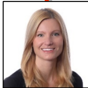
VICE PRESIDENT OF FINANCE & ADMINISTRATION