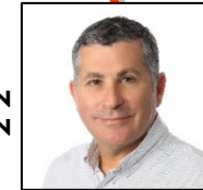
VICE PRESIDENT OF INDUSTRY AFFAIRS