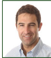
CHAIRMAN BOARD OF DIRECTORS