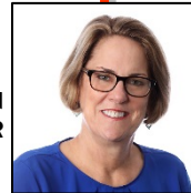
VICE PRESIDENT MARKETING