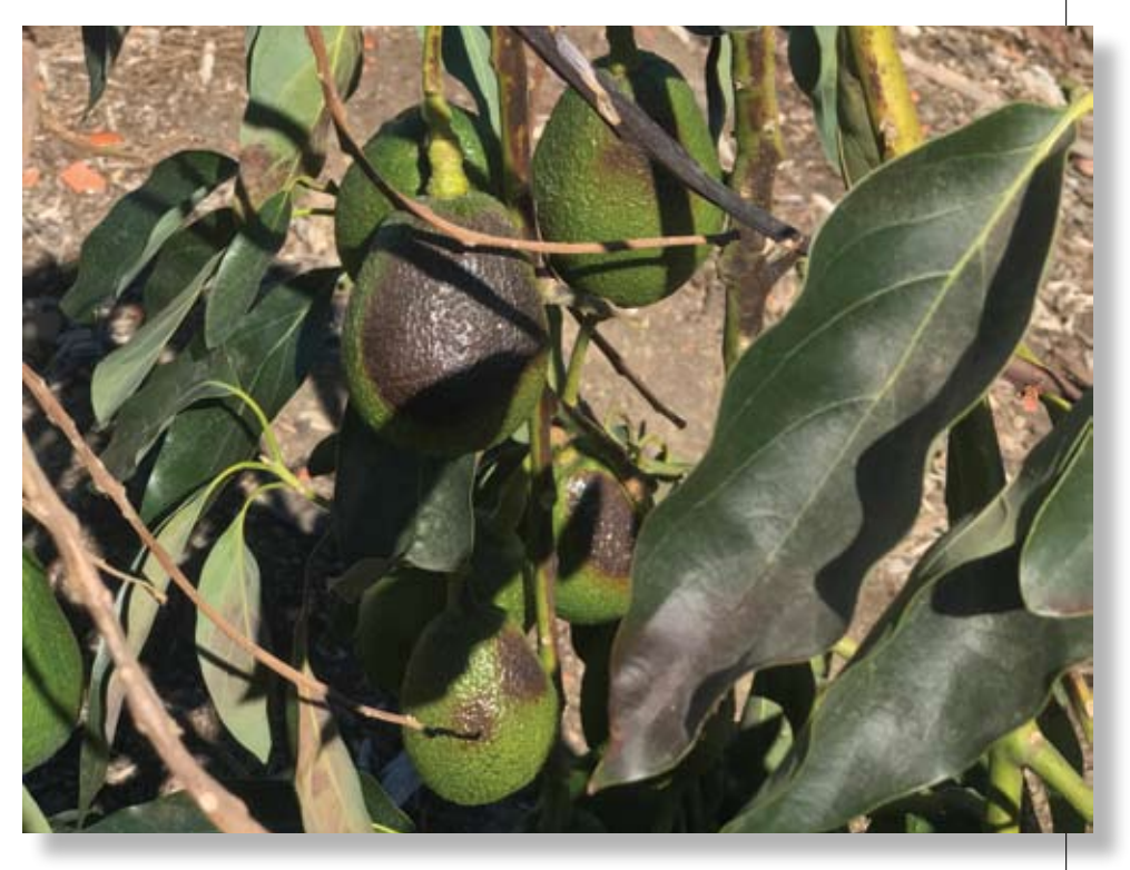
Severe branch and fruit sunburn due to the lack of whitewash following pruning.

Pruning avocados in California is never an easy task since there is always fruit on the trees that will be removed. But following a few basic steps can help ensure that your pruning job doesn't turn into a pruning nightmare.