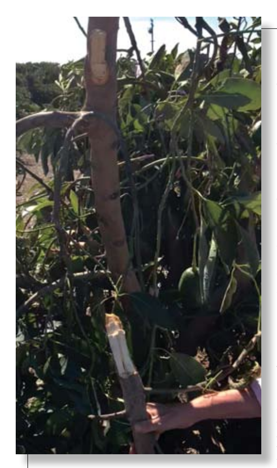
When a large branch is removed without following the three-cut method the result is a large jagged wound that will not heal properly and is an opportunity for disease to enter the tree.

<u>underside</u> of the branch about 12 inches from the branch collar. The relief cut should go about one-third of the way through the branch.