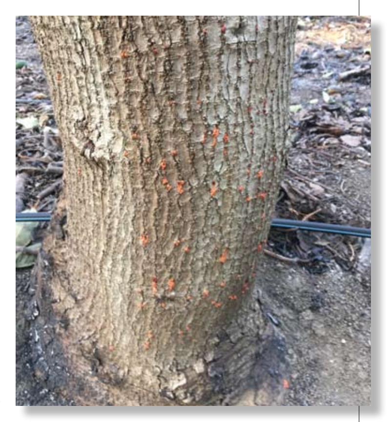
Sap blisters on the trunk of an avocado tree following a fire. These blisters indicate the sap in the tree boiled during the fire and the tree will not recover.